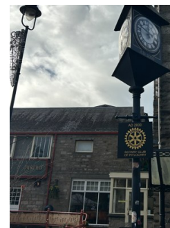
Rotary Clock Tower→ Pitlochry, Scotland