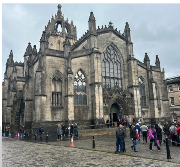
← St Giles Cathedral In Edinburgh